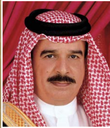
His Majesty King Hamad bin Isa Al Khalifa King of the Kingdom of Bahrain