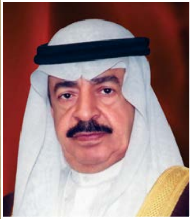
His Royal Highness Prince Khalifa bin Salman Al Khalifa Prime Minister