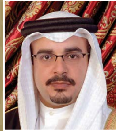
His Royal Highness Prince Salman bin Hamad Al Khalifa Crown Prince & Deputy Supreme Commander First Deputy Prime Minister