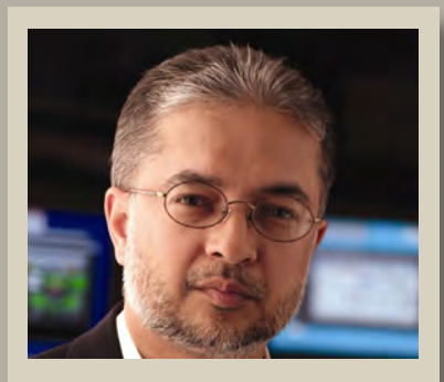
TAKE TEN: Predictions, Trends & Certainties that are Shaping Our Future