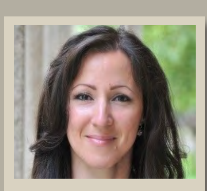
HRM Evolve or Cease to Exist