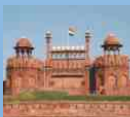
Red Fort, Delhi