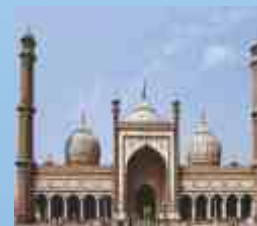
Jama Masjid, Delhi