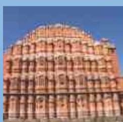
Hawa Mahal, Jaipur