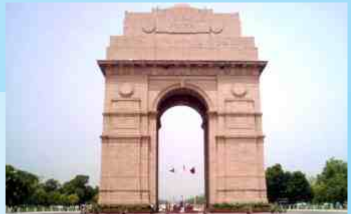
India Gate, Delhi