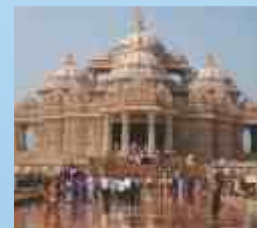
Akshardham Temple, Delhi

Speakers are expected to present quality papers that reflect on the conference themes and sub