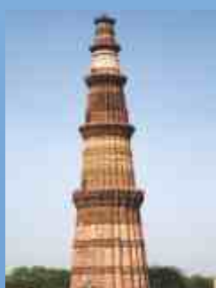
Qutub Minar, Delhi