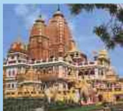
Birla Mandir, Delhi

The climate in Delhi at the time of the conference is pleasant with days usually mild, dry and sunny while early mornings and evenings are cool.