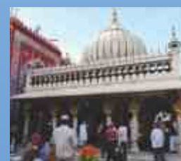
Hazrat Nizamuddin, Delhi